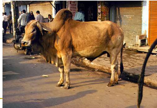
Valencia, 23-24 Oct. 2007